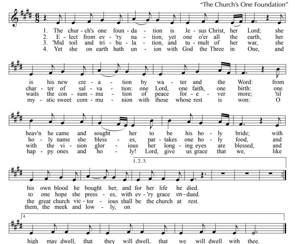
We stand as the Church and declare our commitment to Jesus Christ

So then you are no longer strangers and aliens, but you are fellow citizens with the saints and members of the household of God, built on the foundation of the apostles and prophets, Christ Jesus himself being the cornerstone, in whom the whole structure, being joined together, grows into a holy temple in the Lord. Ephesians 2