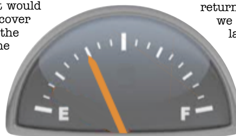
Where we stand on our goal of $3000 per month.

Let us rejoice in the wonder of his goodness, praising him for what he has done and resting in him for the future.